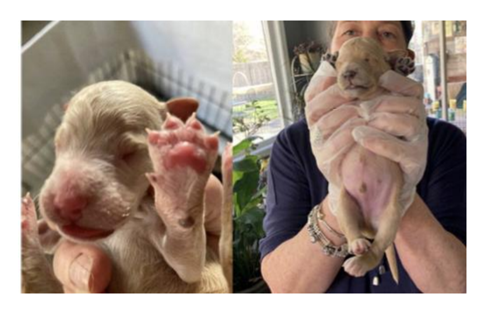
Hypoglycemic puppy after NANO SOMA

"I had a litter of puppies and one was born hypoglycemic, with blood-red paws, face etc. Instead of using high fructose corn syrup to bring the glucose levels up, I used .75 mL of NANO SOMA. I put it on the puppy's lips and watched in awe as the pigment began to fill in the blood-red places. The puppy is developing normally with proper weight gain, nursing beautifully, and seems content. He looks just like his nine siblings now, six days later."