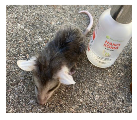
An orphaned opossum reviving after NANO SOMA

To read more testimonials about how the MagicDichol® Family of Products has supported both animals and humans, click here.