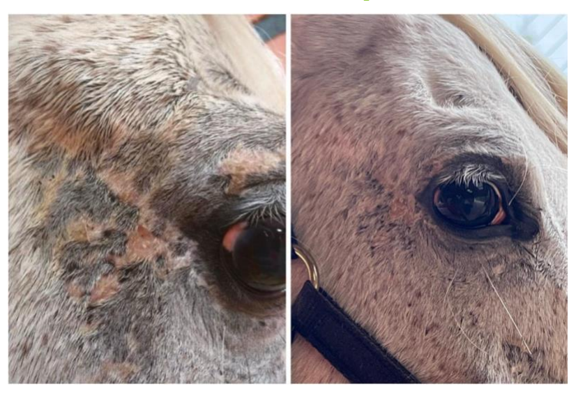
Before & after three weeks with the METASOMER Topical Gel

This horse had a skin issue for eight years. Note the vast improvement after <u>just three weeks</u> with the METASOMER Topical Gel – essentially NANO SOMA with edible Xanthan gum added.